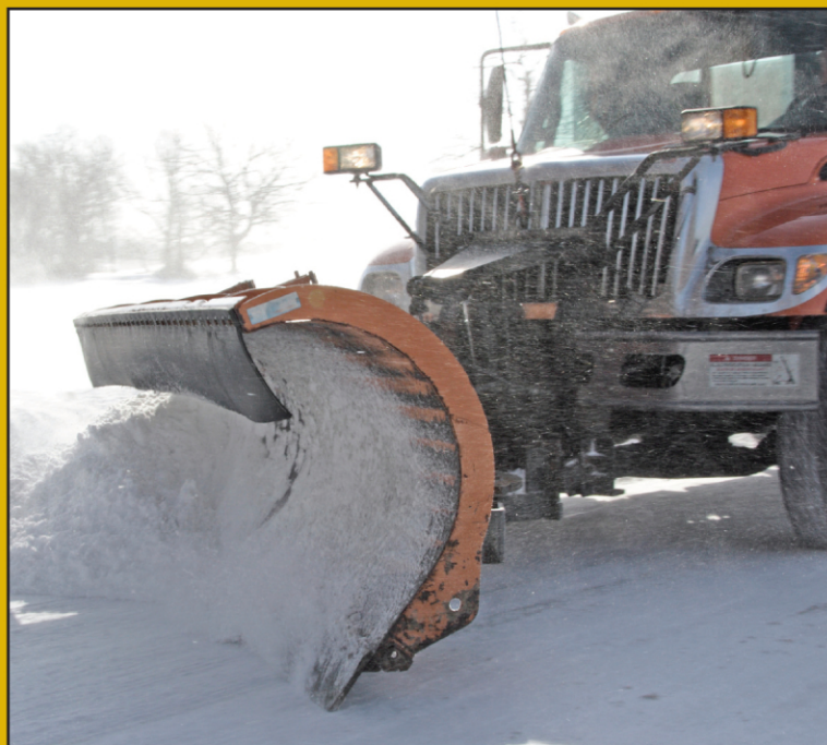
High Carbon Impact Bar